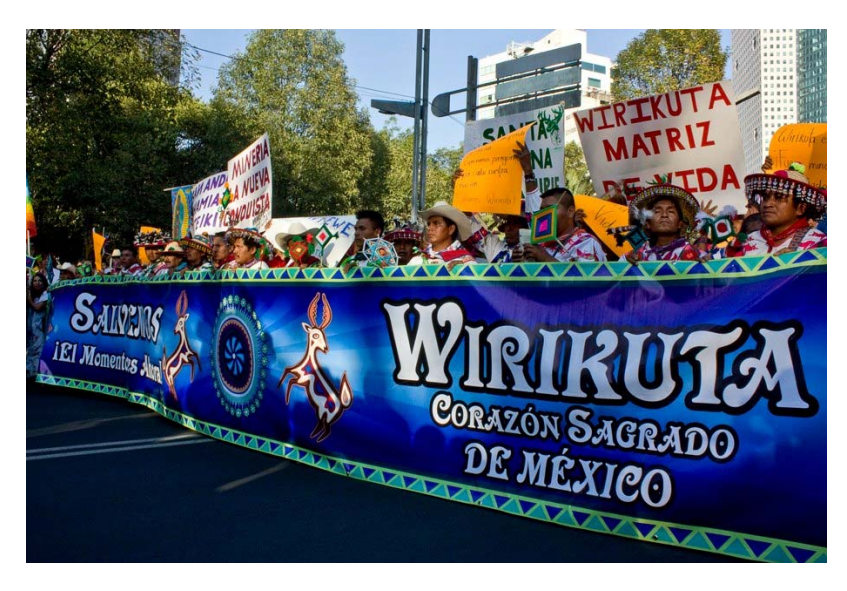
March in Mexico City to Los Pinos

Wixárika people and their representatives so they could attend the various meetings and events being held in Mexico City. From September 7<sup>th</sup> through September 9<sup>th</sup>, Wixárika representatives attended the forum on "Mines in Natural Sanctuaries of Latin America" at the UNAM. A second concert, Watákame, was held on the 14<sup>th</sup> of October at the