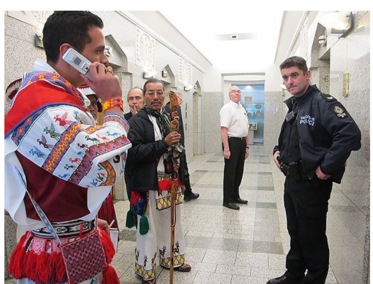
Wixárika delegates waiting to enter the stockholder's meeting of First Majestic Silver Corp.