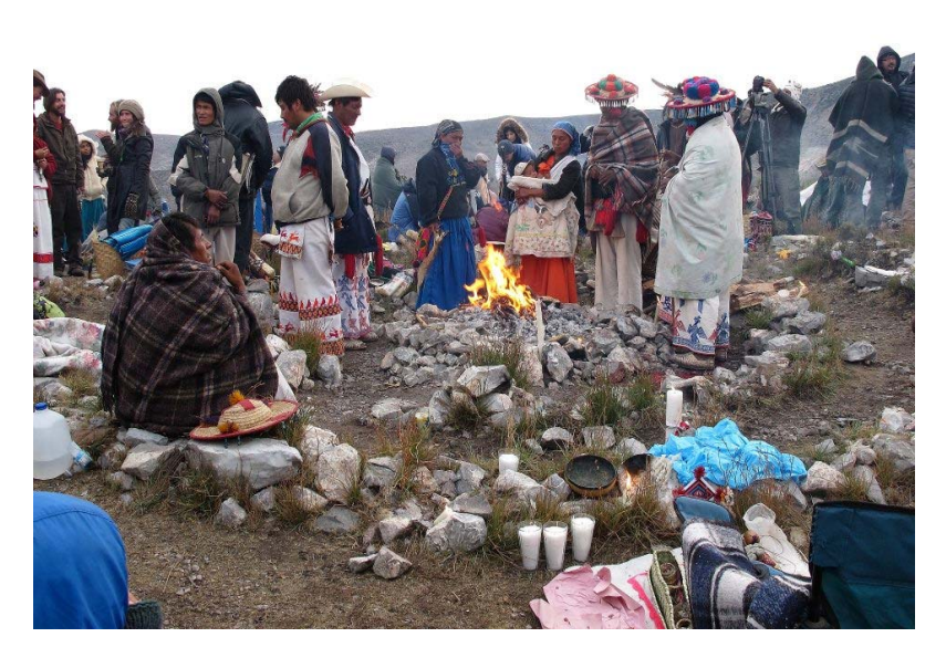
The morning after the vigil on Le'unax+

Wixaritari making the journey. On the night of February 7<sup>th</sup>, the pilgrims climbed to the top of the mountain under a full moon, above Real de Catorce, to their sacred spot, where according to their oral history Our Father Sun illuminated this world to hold their vigil. An exception was made for this special occasion and the visitors, television crews, and reporters, who had traveled to Real de Catorce, were allowed to travel up the mountain to be present and witness this historic ceremony. Once again the issue of mineral exploitation