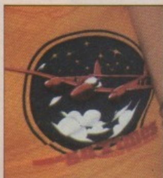
HIGH STYLE: TEEING UP 119