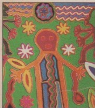
PEYOTE VISIONS 81