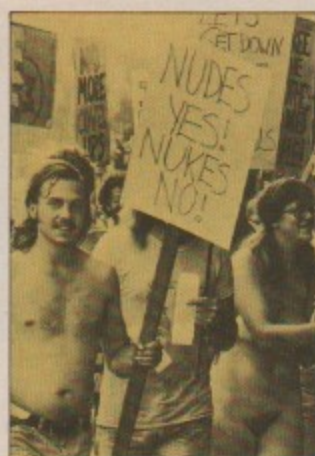
HIGHWITNESS NEWS 35