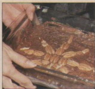
CANNABIS COOKBOOK Laurence Cherniak 96