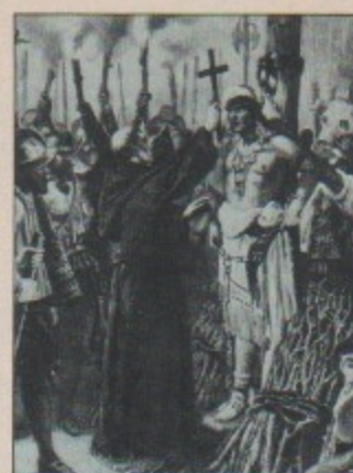
THE PLANET 127